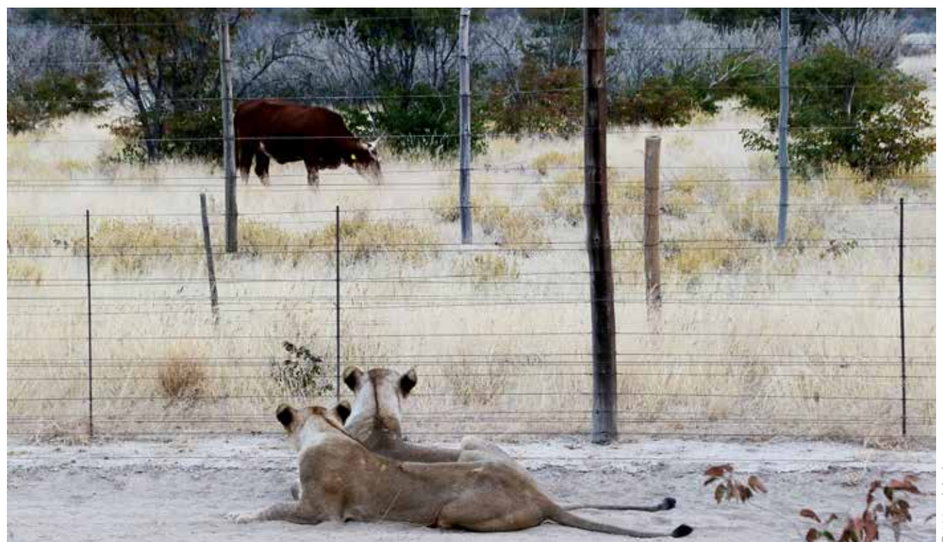
O I Mon

In Namibia the primary and most overarching threat to lions is persecution for livestock predation. Lions can be relatively easily tracked down and shot or speared, seldom moving far away from the carcass of an animal they have killed, and their scavenging behaviour makes them particularly vulnerable to poisoned carcasses put out to eliminate predators. Lions are thus very vulnerable to persecution and can suffer dramatic population declines when it intensifies (Kissui 2008).