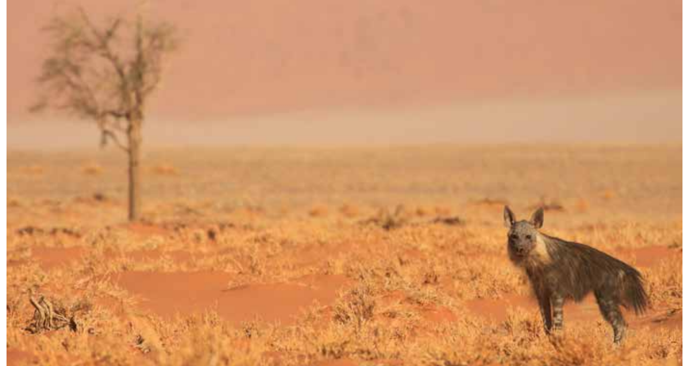
O D Dort