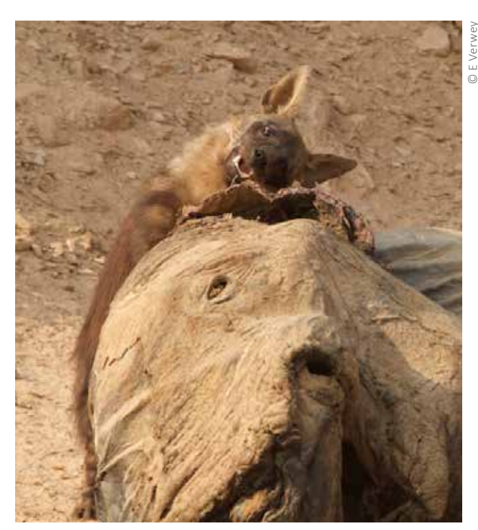
the importance of detailed monitoring studies necessary in these areas.

The current population trend is stable. However, there are numerous researchers and farmers that report a perceived increase in brown hyaena numbers, especially in the Khomas Hochland area. It is not entirely clear whether this is just a result of this cryptic species becoming more visible through the use of camera traps as a monitoring tool, highlighting